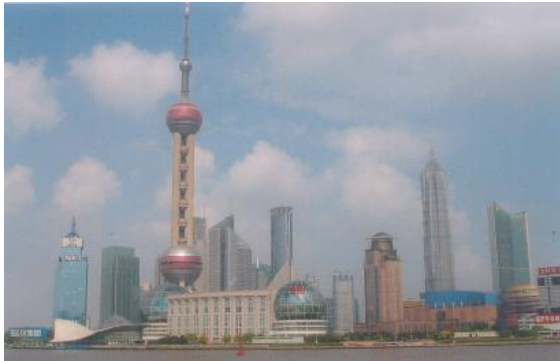
The Wonderland look of modern Shanghai

be restored in the 18th century. This house and garden was the residence of a retired bureaucratic official who stated at one time that he “Would have sooner become a fisherman”: hence the name, Master of the Nets.