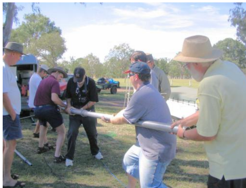
The pneumatically-elevated 16 m mast went up easily, but was reluctant to telescope down. A little brute force and intelligence solved the problem.

The meeting is primarily a social gathering, where local amateurs get to meet face to face the people they have been talking to on air for years. The emphasis is on having an enjoyable time, chatting and comparing notes with like-minded people. Some ham radio activities manage to sneak in of course, with HF, VHF and UHF bands being activated throughout the weekend, in between meals, chats and bush