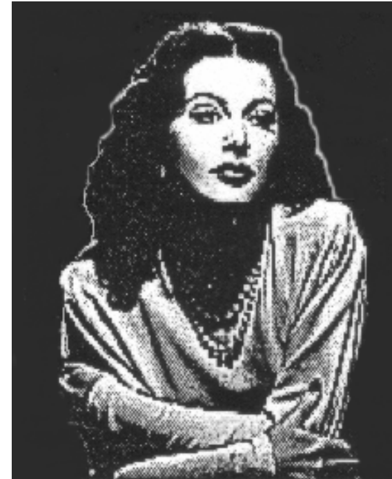
Hedy Lamarr—movie star, radio communications innovator