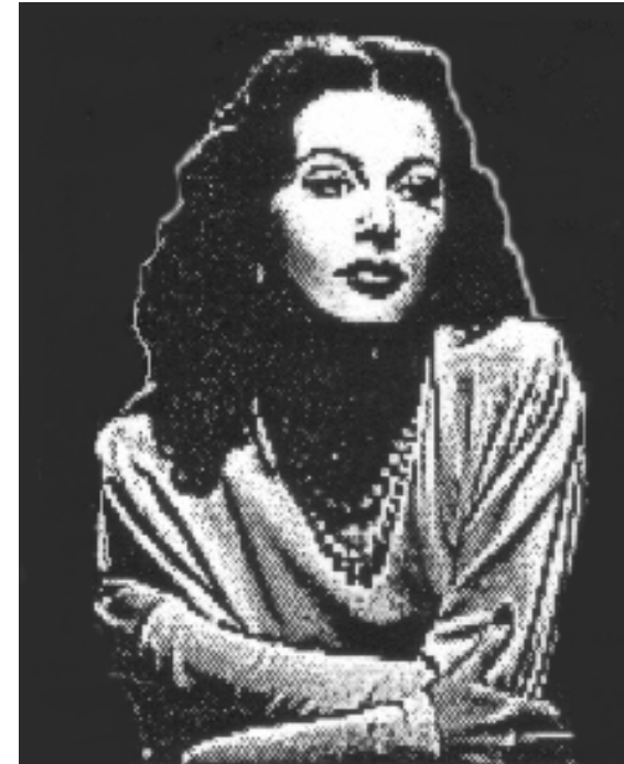
Hedy Lamarr—movie star, radio communications innovator